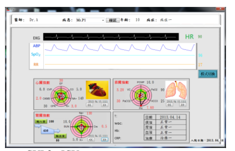
Fig. 2. Prototype GUI for ICU.